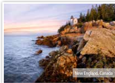
New England, Canada